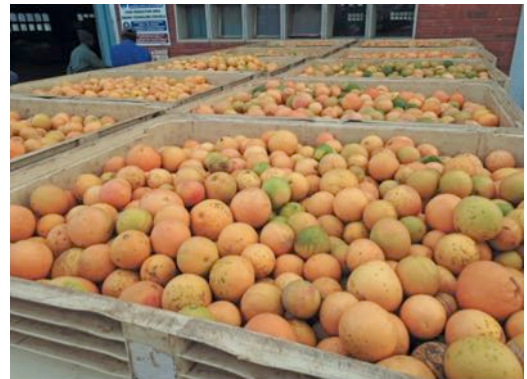
Grapefruit like these that are not suitable for export are sold locally, at a much lower profit.