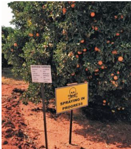
SIZA requires that farmers provide working conditions that are healthy and safe for their workers.